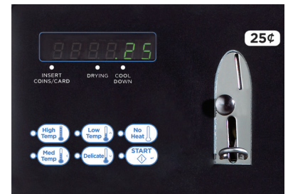
Vended Microprocessor Control