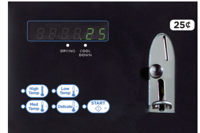
Vended Basic Digital Control